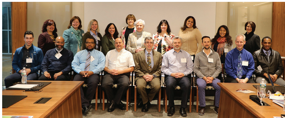
Representatives from 14 Adventist academies and schools in North America gather for meetings at the NAD headquarters in Columbia, Maryland.

PSI also convened a meeting approximately a year ago of academies that have successfully implemented, maintained, and expanded their fundraising, whether or not they were part of the MAP program. This group, the Advancing Academy Philanthropy (AAP) participants, was convened by invitation and offered suggestions for programs and materials, most of which PSI has developed and disseminated.